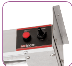
Undermount bracket without chain