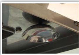
Convenient Snow Cone Shaper