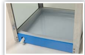
Molded Plastic Drainage Deck