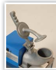
Cast Aluminum Assembly