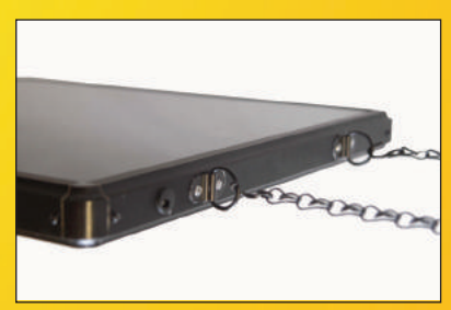
Aluminum Frame Only 1.25" Thick