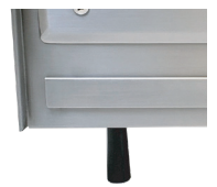
3" Legs for Easy Cleaning