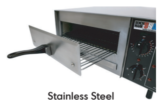
Stainless Steel Construction