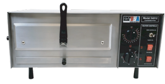
Fully Insulated Max Outside Temp: 150°F

It is equipped with 3" long legs that make cleaning under it easy and convenient. Unlike ordinary counter top ovens, the fully insulated stainless steel cabinet will not reach an outside temperature of over 150°F, thereby reducing the possibility of accidental burns.